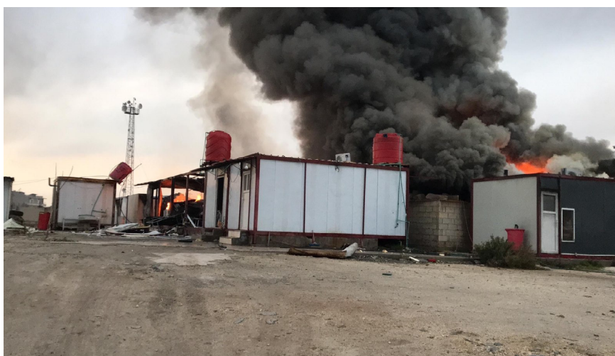
Meshtanour clinic, Kobane, 25.12.2023

-The Turkish-backed Syrian National Army (SNA) have upped their shelling along the contact lines separating DAANES-governed areas from the Turkish-occupied areas of NES, striking villages around Shehba and Manbij