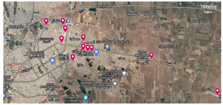
Turkish airstrikes on Qamishlo, 25.12.2023