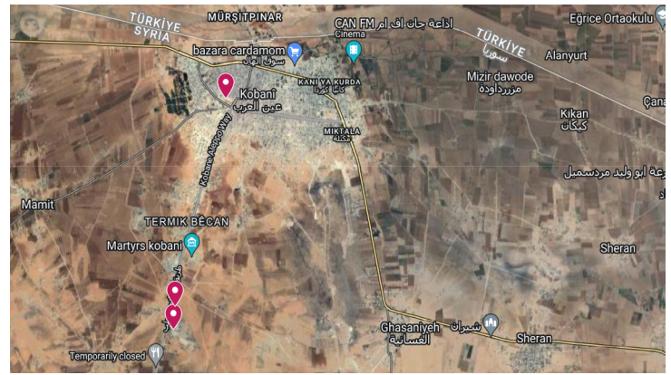
Turkish airstrikes on Kobane, 25.12.2023