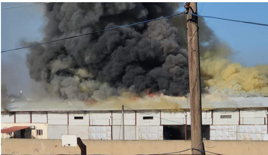
Industrial site, north-east Qamishlo, 25.12.2023

-NES' political and military leaders have long emphasised that the political and military institutions in NES are separate from the PKK – contrary to Turkey's claims – and now accuse Turkey of "exporting its internal crises" and conducting airstrikes to deliberately create instability and target the DAANES