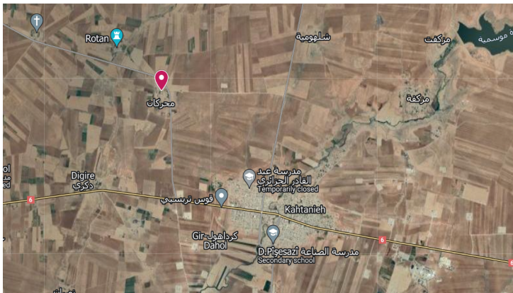
Turkish airstrikes on Tirbespi, 25.12.2023